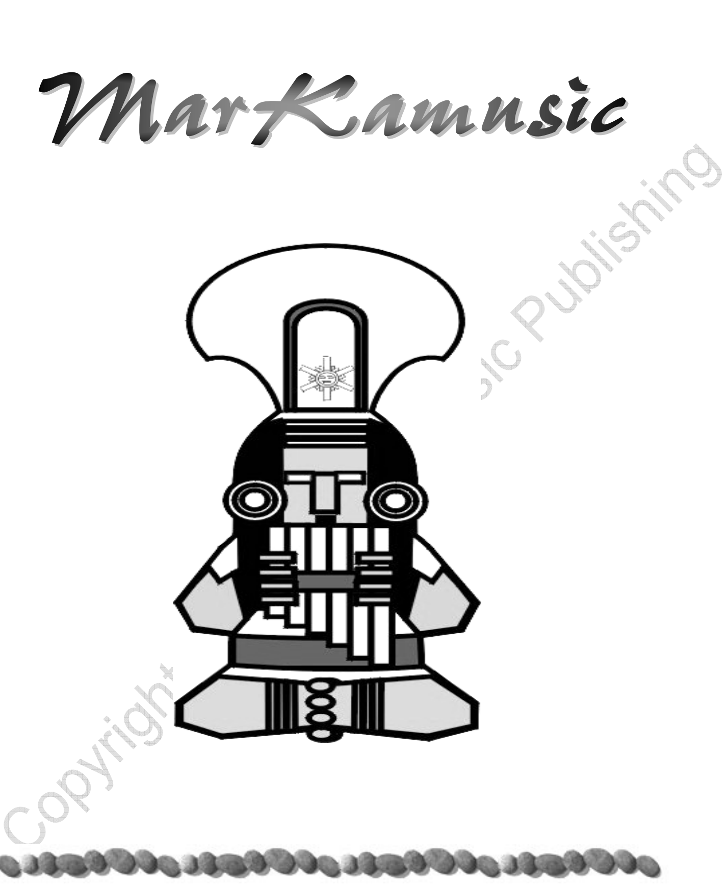
THE SOUNDS OF SOUTH AMERICA